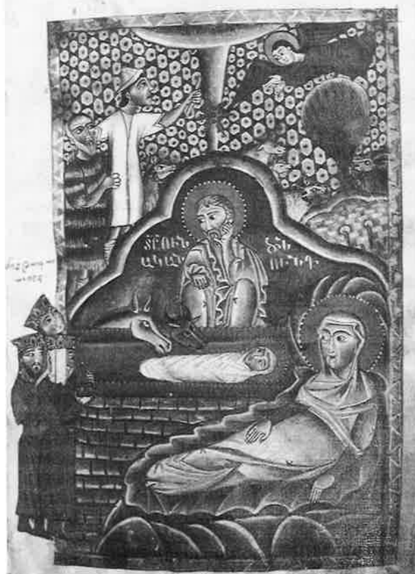
Gospel No. 47: Nativity (1330 A.D.)

It is safe to declare, that inasmuch as the New Julfa collection is the focus of this study, the latter presents a precis of the available knowledge to be found anywhere. The New Julfa evidence is skillfully integrated into the wider spectrum of medieval Armenian art, so that the non-expert may gather a considerable amount of general information from it. One must also note that the western influences so vividly present in New Julfa as perhaps in no other medieval Armenian community ever, are also assessed and exposed.