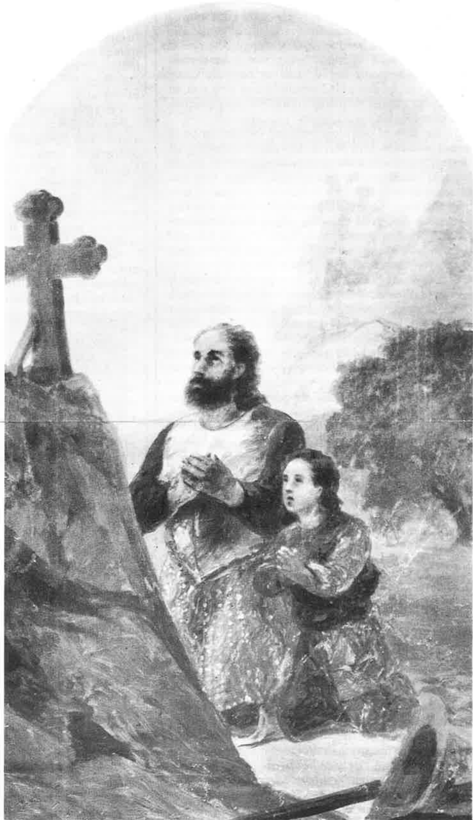
Ս. ՎԱՐԴԱՆ Յովհաննէս Այվազովսկի, 1892