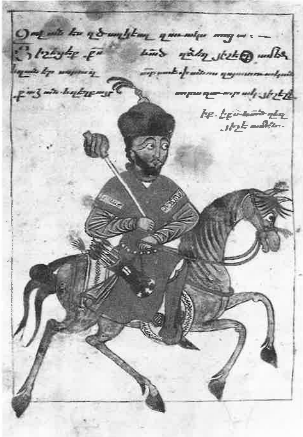
Gospel No. 481: the Son of the Donors (1330 A.D.)

fluences and counterinfluences of artistic styles and schools of illumination and decoration, of tradition and innovation, of external factors and local-inherent motifs is most meticulously researched and eloquently presented, as usual. Interrelations among various schools of Armenian art are defined, clarified, their extent established upon detailed examinations and comparisons of individual components of the collection, as well as some of their sub-components. Professor Der Nersessian dwells on the correlation of the New Julfa school of illumination and those of Cilicia, Siunik, and Vaspourakan in particular, noting general trends, underlying conceptions, similarities, and divergences and accounting for them.