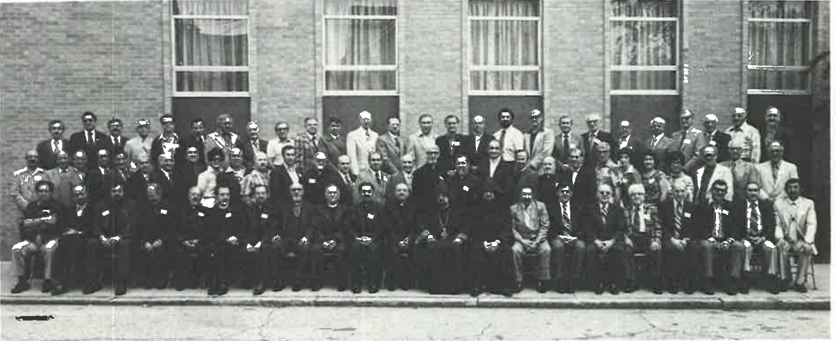
Delegates to the National Representative Assembly - Providence, R.I. - May 15-18, 1979