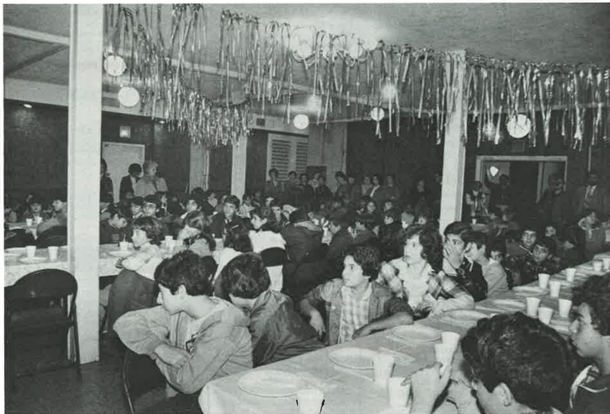
Children share breakfast together in St. Illuminator's Cathedral in New York City, prior to their visit to the United Nations.