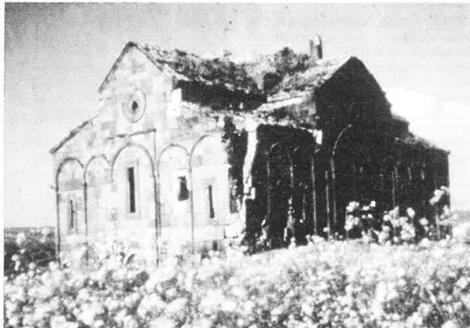
THE GREAT CATHEDRAL OF ANI

Like the ruins of all great cities, Ani today is a sad and silent place. In winter, the stark wind-and-snow winter of Turkey's high mountains, it suggest somehow that man, not nature, has destroyed it; it looks rather like a village in France after the shelling had stopped and the troops had moved on.