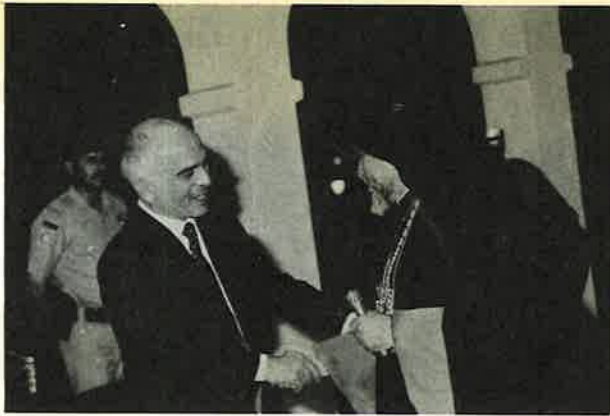
His Holiness Catholicos Karekin II is greeted warmly by His Majesty King Hussein of Jordan, during His recent visit to Amman, Jordan. During His four day visit, His Holiness met with the king and high ranking officials to discuss many important issues related to peace efforts in the Middle East and particularly in Lebanon.

Ընծայեալը հոն է, խորանին դիմաց, ինքնամոփոփ եւ աղօթամարմունջ: Եկեղեցւոյ զանգերուն զօղանջը կ'աւետէ Ս. Պատարագի սկիզբը: «Սորհուրդ