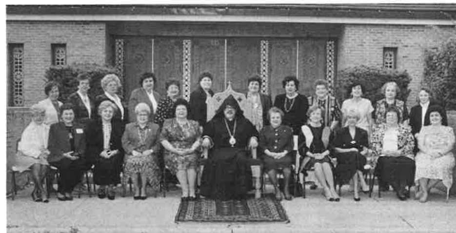
National Association of Ladies' Guilds Annual Meeting took place concurrently with the National Representative Assembly.