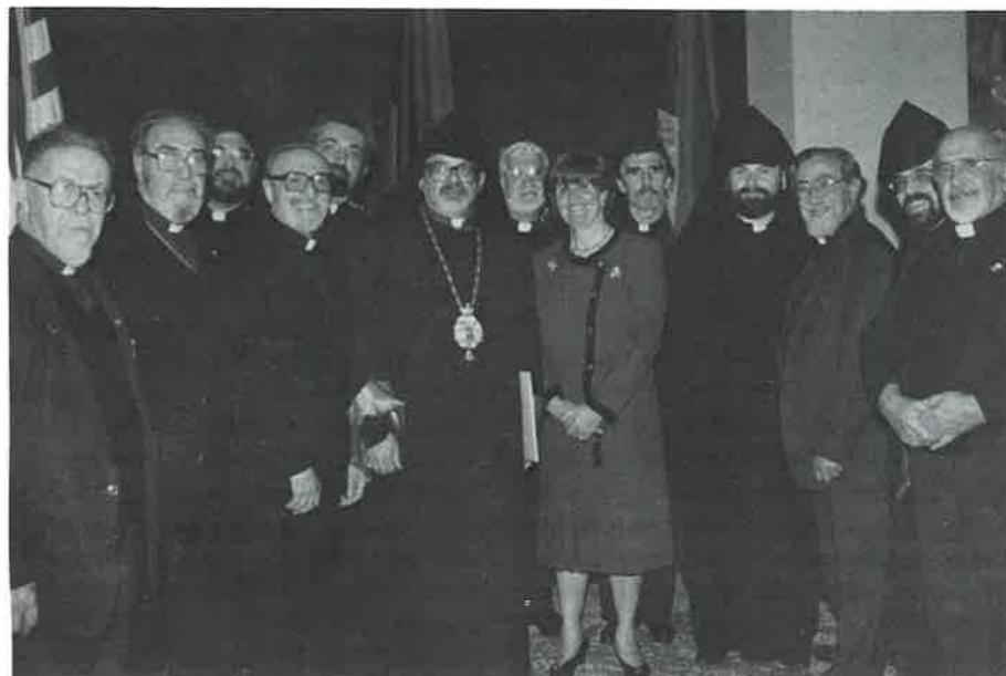
Lady Caroline Cox surrounded by clergymen following the presentation of the 1994 Spirit of Armenia award during the National Representative Assembly.