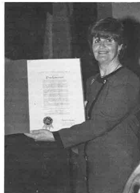
Lady Caroline Cox shows the proclamation issued by the Mayor of Philadelphia on the occasion of her receiving the Prelacy's Spirit of Armenia Award.