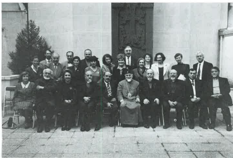
His Holiness Karekin I, Supreme Patriarch and Catholicos of All Armenians, with members of the Exhibitions Committee which recently met in Paris to discuss and plan a schedule of international exhibits during the next five years.

The advisory committee on exhibitions for the 17th Centenary of Christian Armenia met in Paris in February, bringing together committee members as well as guests and specialists in order to plan and discuss the schedule of exhibits for the next five years.