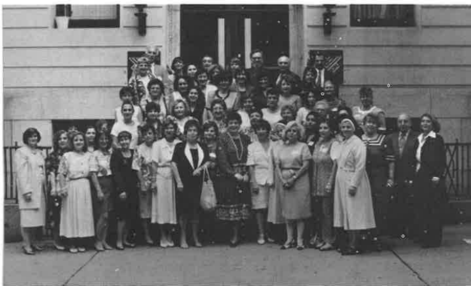
Participants at ANEC's 1996 Educators' Seminar which took place at the Prelacy take time out for a group photograph. More than 60 educators from seven states attended the informative seminar.