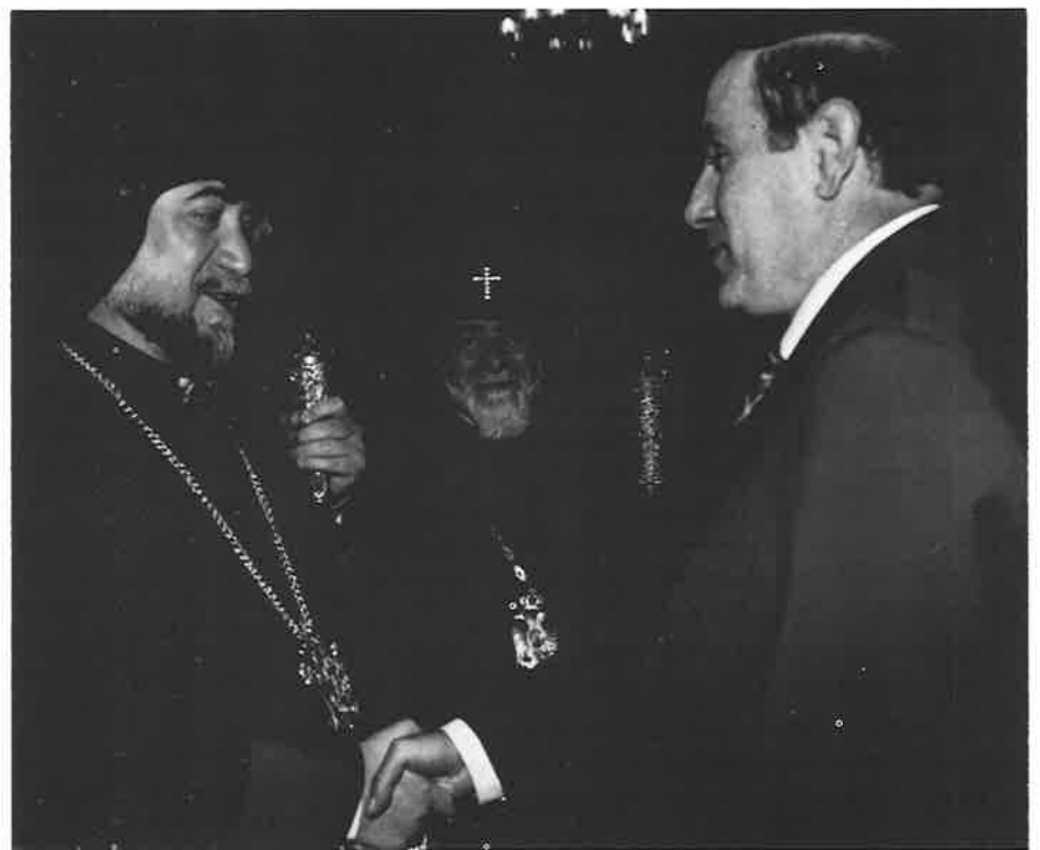
Catholicos Aram greets Levon Ter-Petrosyan, President of Armenia. Catholicos Karekin I in center of photo.

For Information about the Pontifical Visit Contact the Prelacy, 212-689-7810