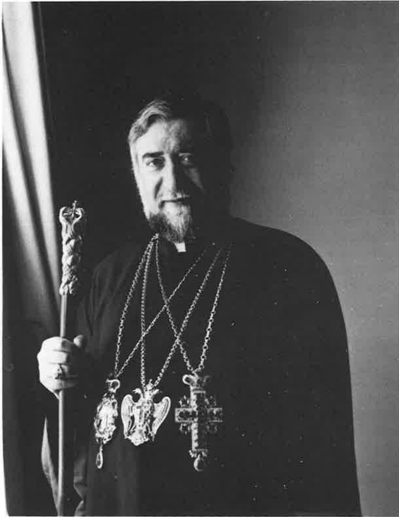
His Holiness Aram I Catholicos of the Great House of Cilicia

His Holiness Aram I is the spiritual leader of the Holy See of Cilicia of the Armenian Apostolic Church. He was consecrated as the Catholicos of Cilicia on July 1, 1995, after serving as Primate of the Armenian Orthodox community in Lebanon for 15 years.