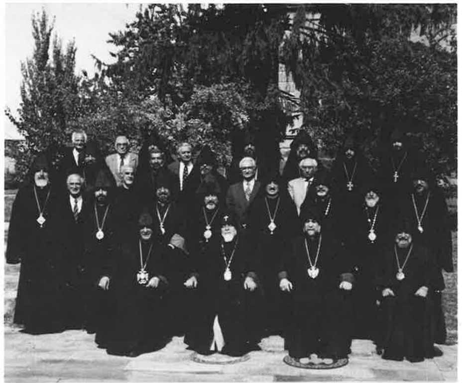
17th Centenary Meeting in Etchmiadzin: Front row, H.B. Archbishop Torkom Manoogian, Patriarch of Jerusalem; H.H. Karekin I, Supreme Patriarch and Catholicos of All Armenians; H.H. Aram I, Catholicos of the Great House of Cilicia; Archbishop Karekin Kazanjian, Patriarch of Constantinople.

His first visit to the Eastern United States and Canada will begin October 1, 1997, and continue through to November 10, 1997.