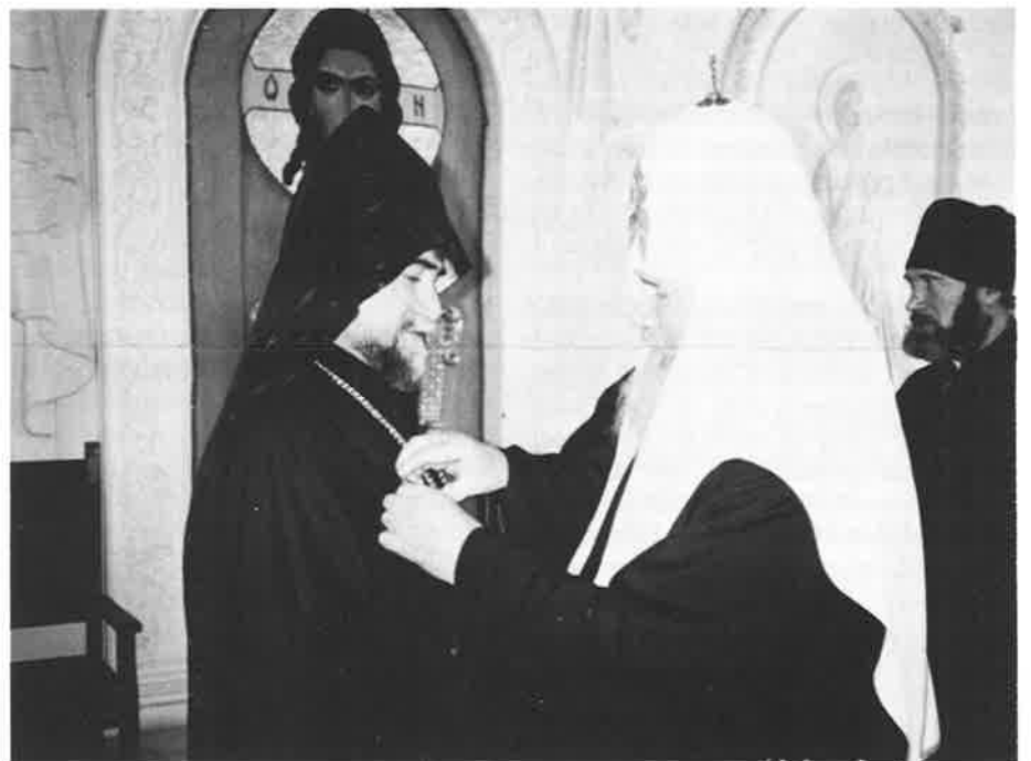
Russian Patriarch Aleksy I presents medal to Catholicos Aram I during Moscow meeting.