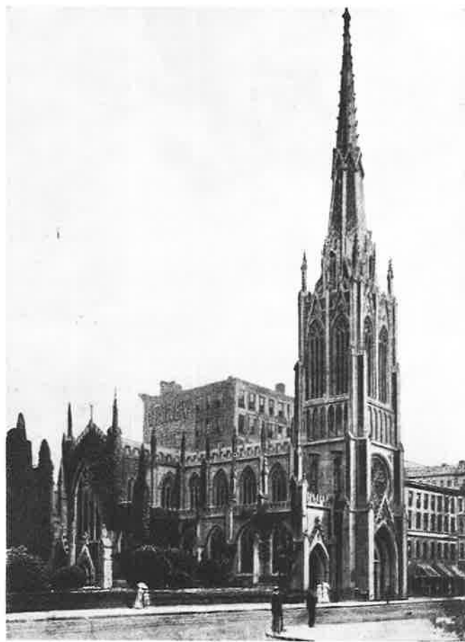
2009—Grace Church, New York.

On Saturday, October 4 at 3 p.m. a Student Festival with the participation of the area's Saturday and Day Schools, will permit the Catholicos the opportuni-