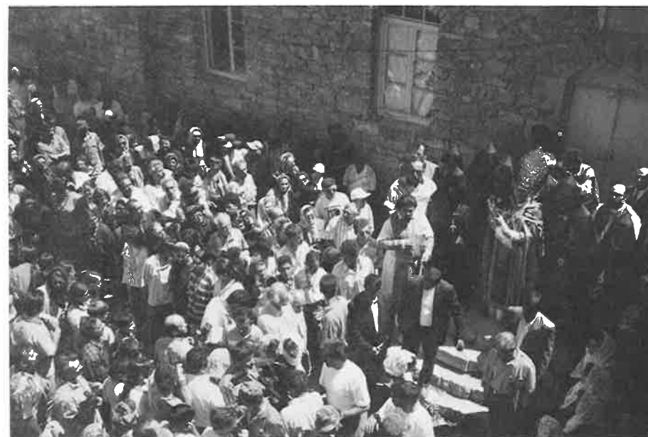
Aram I blesses the faithful at St. Thaddeus Monastery with the relic of St. Thaddeus.

գաղափարին մասին, վեր առաւ առաքելներու քրիստոսատիպ գործունէութիւնը եւ ի մասնաւորի Սուրբ Թադէոսի Հայաստան աշխարհին լոյս բերելու եւ լոյս ըլլալու իրողութիւնը, ընդգծեց որ հայութիւնը ըմբռնեց թէ «Գողգոթայի ճամբան, Քրիստոսի ճամբան, յարութեան ճամբան է, իր հայրենիքով, Արցախով եւ Սփիւռքով ապրեցաւ առաքելատիպ՝ արեւան վկայութեան ճամբան»: Իր պատգամը փակեց վերջիջելով շարականագրի բառերը, ուղղուած Ս. Թադէոս Առաքելին, զինք բնորոշելով կեանքի նշանաւոր գնացարհ, լոյսի աղբիւր, հօր աշտարակ եւ նահատակ բարի Քրիստոսի: