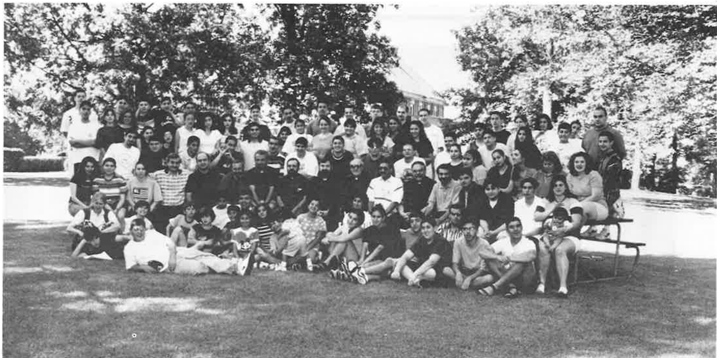
Students and staff of the 11th annual St. Gregory of Datev Institute Summer Religious Studies Program.