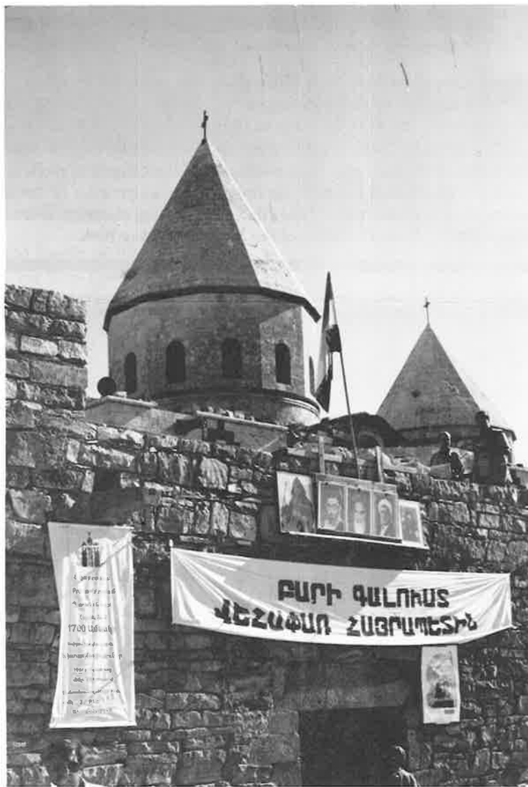
Colorful banners welcome His Holiness to the Monastery.