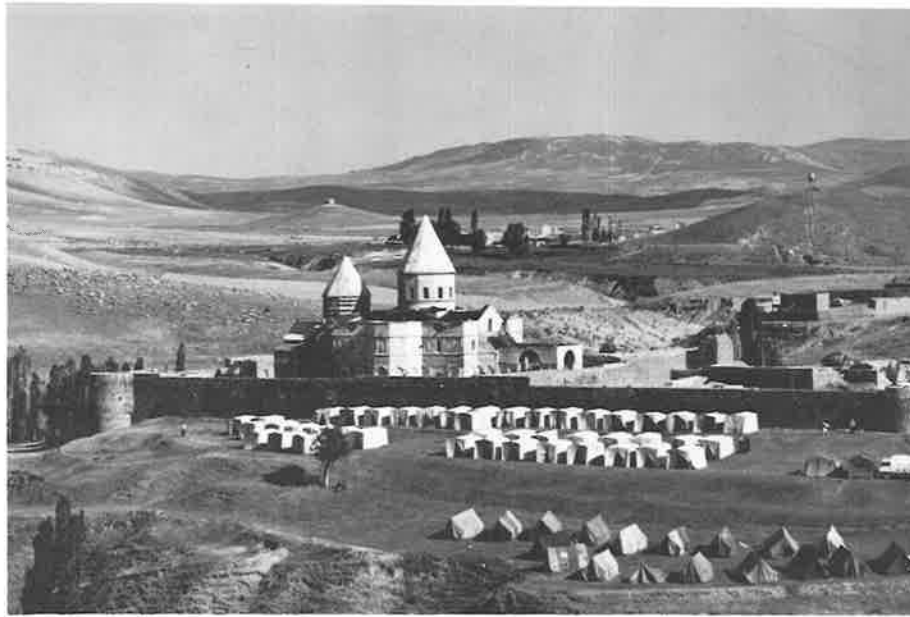
A view of the St. Thaddeus Monastery in Iran where pilgrims journeyed for the annual St. Tadeh Holiday in July. His Holiness Aram I attended and presided making this the first time in history that a Catholicos has participated in this annual pilgrimage.

Վեհափառը, իր պատգամին մէջ, խօսելով մարդկայեալ Աստուծոյ առաքելութեան՝ իր անձը համայն մարդկութեան ընծայելու