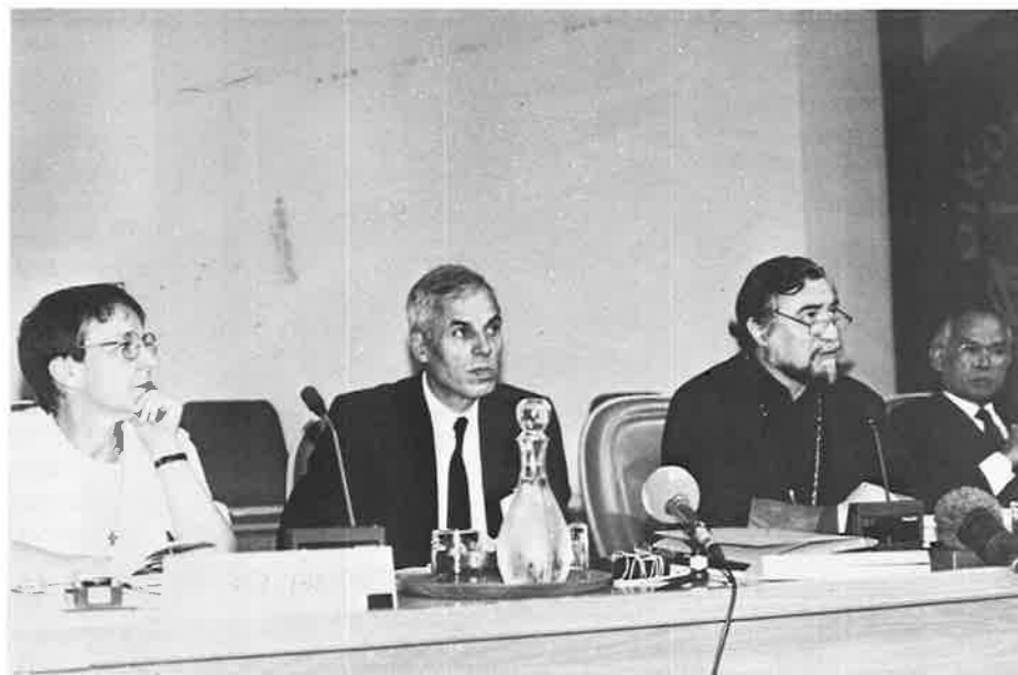
Catholicos Aram during one of his many ecumenical meetings.