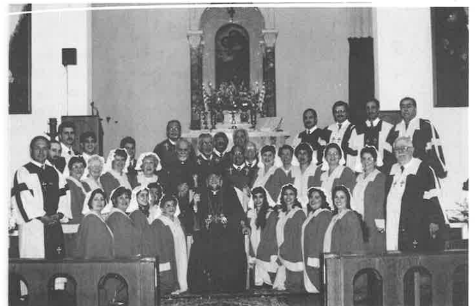
St. Sarkis Church, Dearborn, Michigan.