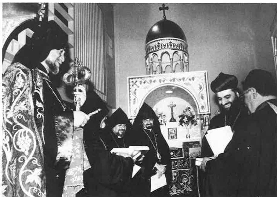
A prayer service at the Syrian Orthodox Church in Teaneck, New Jersey.