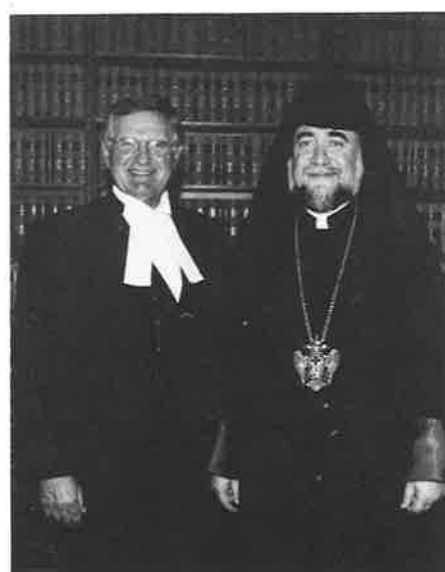
With the Speaker of the House in Ottawa.