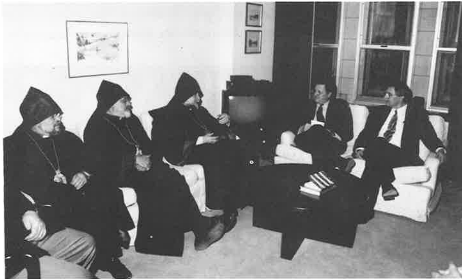
Meeting with the Minister of Foreign Affairs.