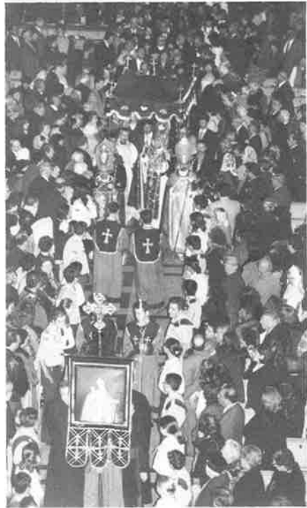
The procession leaving the Basilica of St. Marie du Monde in Montreal.