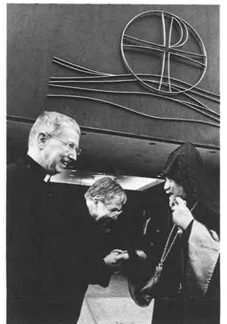
Being welcomed at the Catholic Near East Relief Center in New York.