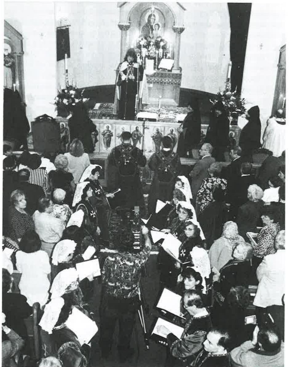
Vehapar began his pontifical visit in the New York-New Jersey area. This photo, taken at St. Illuminator's Cathedral, New York City, is his first of many Hrashapar Services. His Holiness's message delivered on this occasion is on page 2.