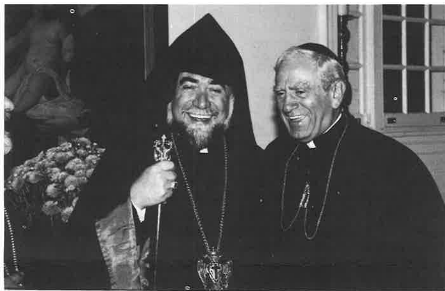
A joyful moment with Cardinal Anthony Bevilacqua in Philadelphia.