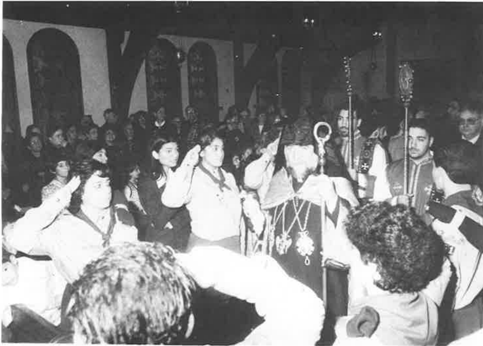
Sts. Vartanantz Church, Providence, Rhode Island.