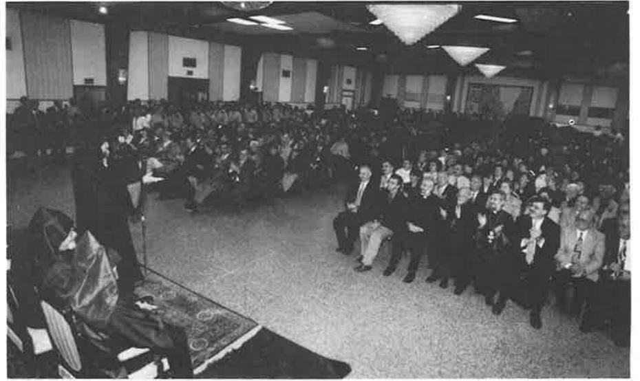
Vehapar addresses the community in Laval.