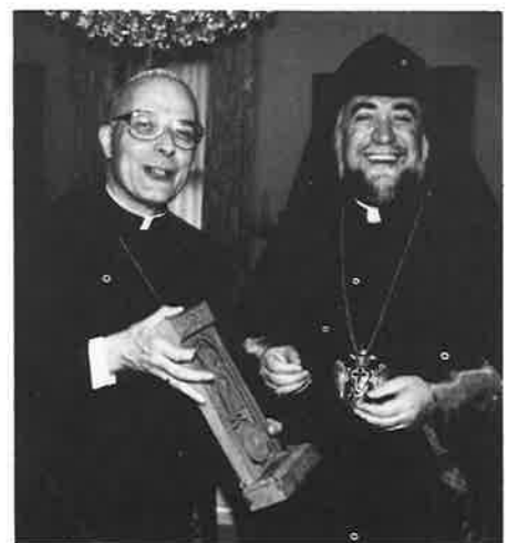
Presenting a Khatchkar to Archbishop Francis E. George of Chicago.