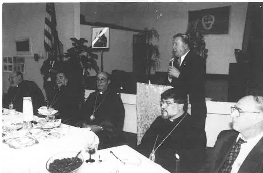
Mayor of Niagara Falls welcomes Vehapar.