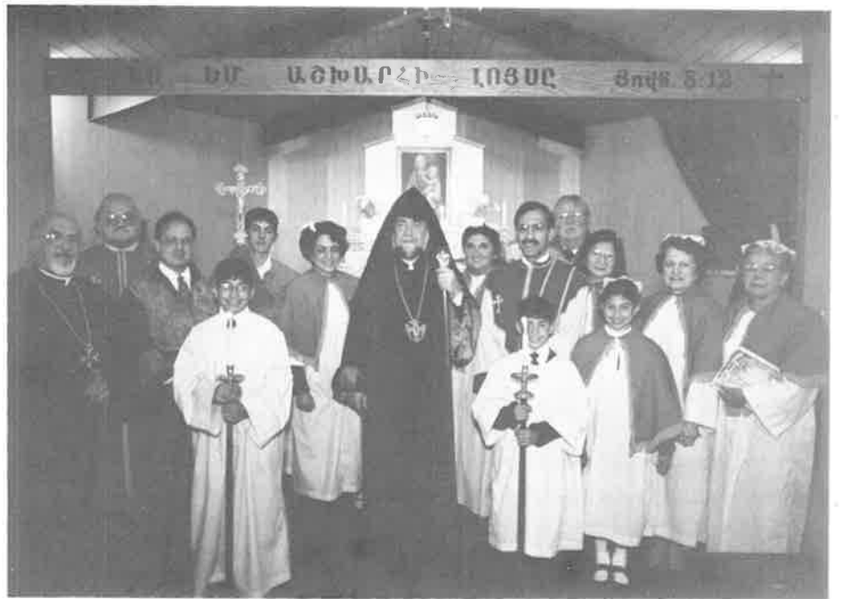
St. Paul Church, Waukegan, Illinois.