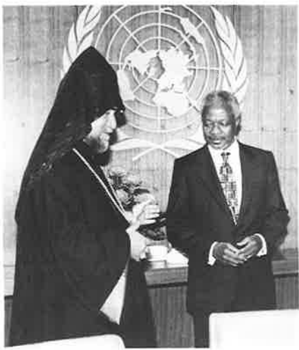
With the General Secretary of the United Nations, Kofi Annan.