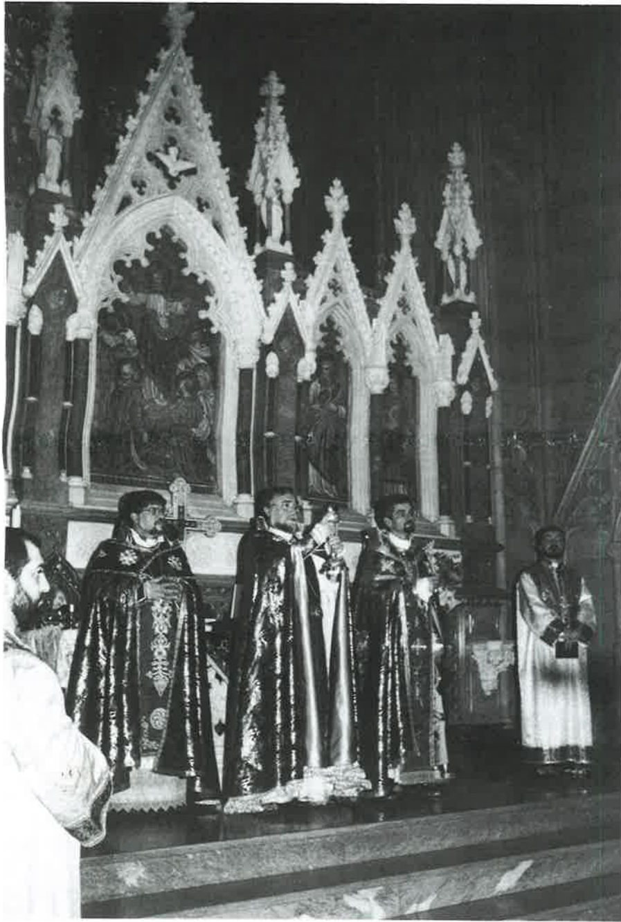
A high point of the visit was the Pontifical Divine Liturgy in the historic Grace Church on October 5. Grace Church was the site of the first Armenian Liturgy celebrated in New York nearly 110 years ago.