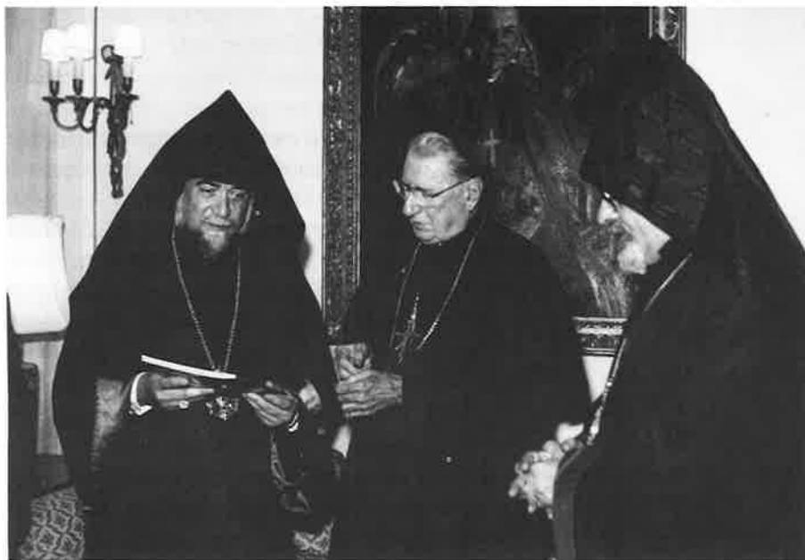
Exchanging gifts with Cardinal John O'Connor at Archdiocese in New York.