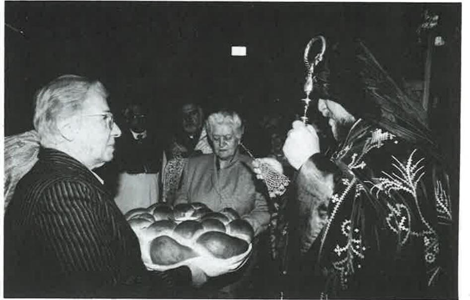
In each community he visited the Catholicos immediately performed the traditional blessing of bread and salt, as this photo shows in Toronto.