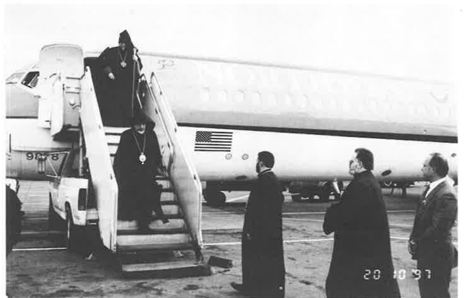
Arriving in Troy, New York.