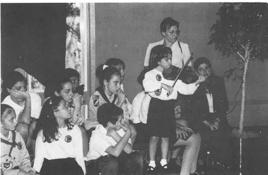
Young parishioners in Washington, DC area entertain His Holiness.