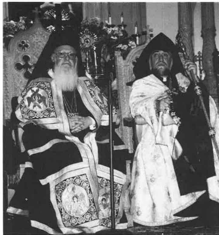
Patriarch Bartholomew and Catholicos Aram at the altar of St. Stephen's Church in Watertown present their message to the Faithful.

The two church leaders were escorted into St. Stephen's Church by an impressive and colorful procession of clergymen, choristers, acolytes, cross and banner bearers, candle holders, censer and fan bearers, with all of