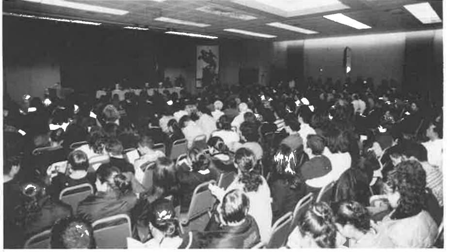
Hundreds of young people came to meet the youth program in Montreal.