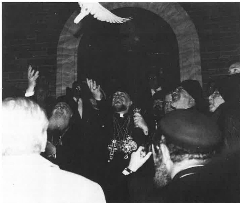
Doves of peace and brotherhood are released at the conclusion of the service.

Expressing the need for better mutual understanding, the Ecumenical Patriarch proposed "an exchange of students and people between the Holy