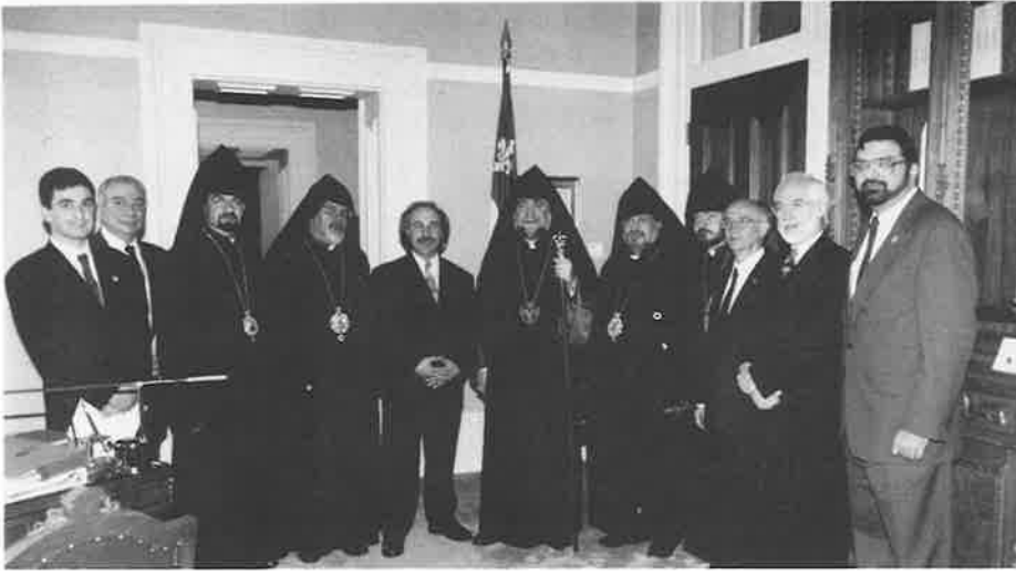
With the president of the National Assembly of Quebec.