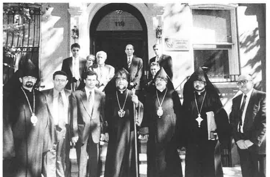
A visit to Armenia's Mission to the United Nations.