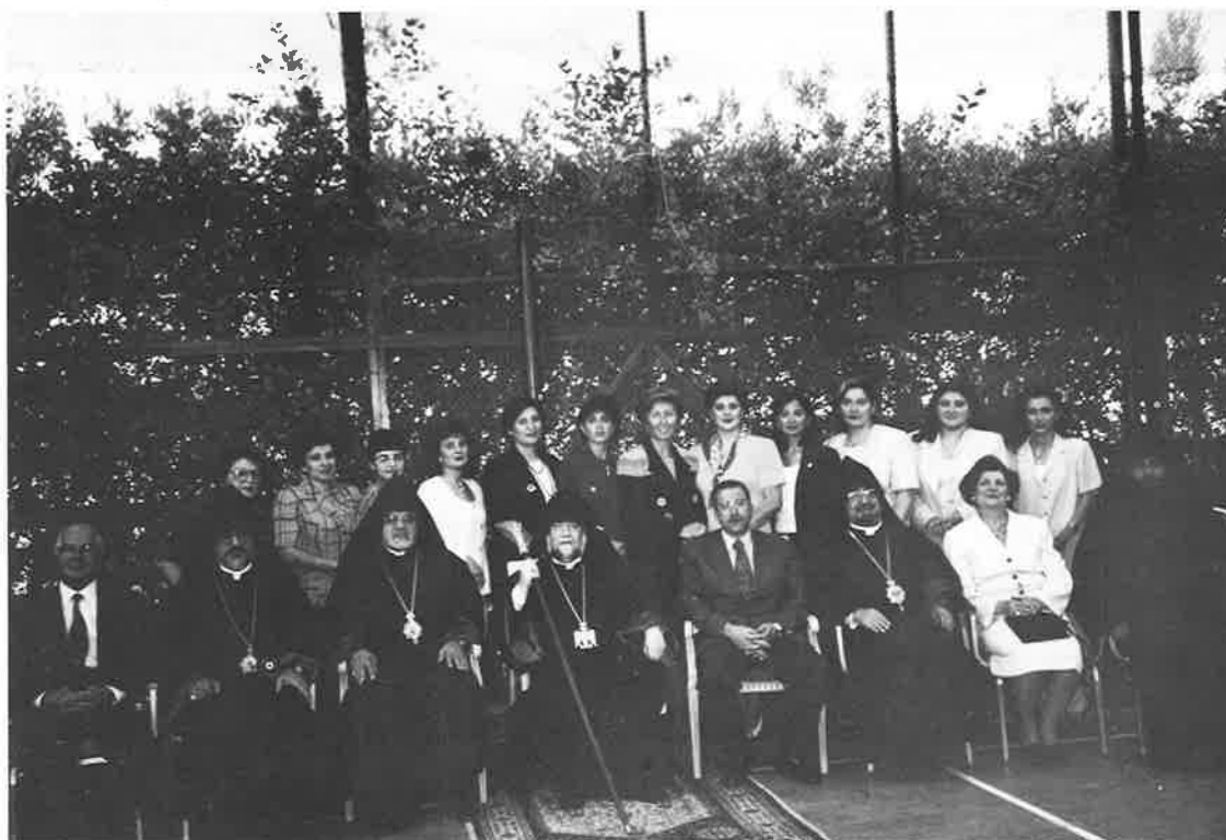
Aram I and entourage visit with faculty and administration of Armenian School in Abu Dhabi. The first Armenian Church in the region was recently consecrated in Sharjah, United Arab Emirates.

Several years ago, on the request of His Holiness Karekin II, Catholicos of Cilicia (now Catholicos of All Armenians in Etchmiadzin, Armenia), a plot of land was granted to the Armenian community of the Northern Emirates to build a church in Sharjah. ✚