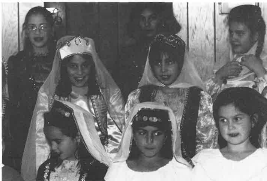
Young children of the parish perform for the Prelate and guests during a banquet following the Divine Liturgy.