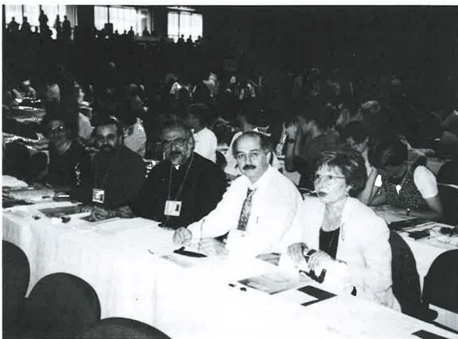
The Prelate and the delegates of the Cilician See at the World Council of Churches 8th Assembly which took place in Zimbabwe.