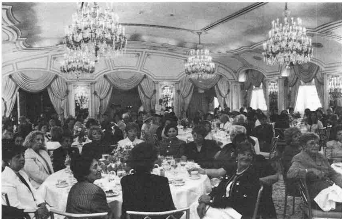
A scene from the luncheon at the St. Regis.