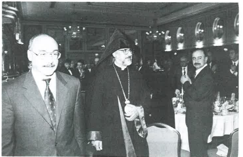
The President of Karabagh and His Eminence enter the ballroom.