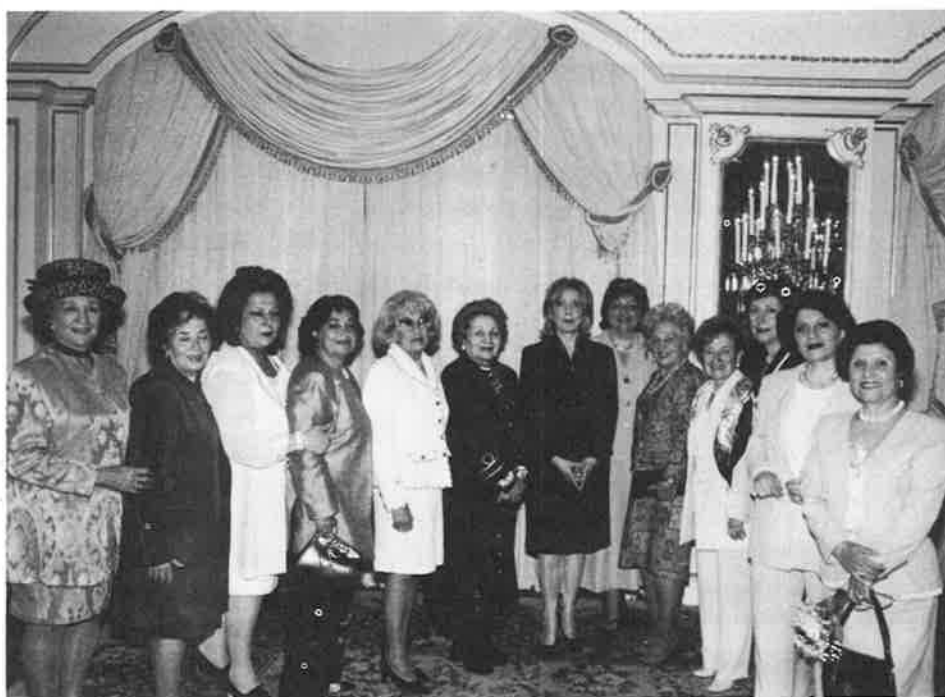
Current PLG Members