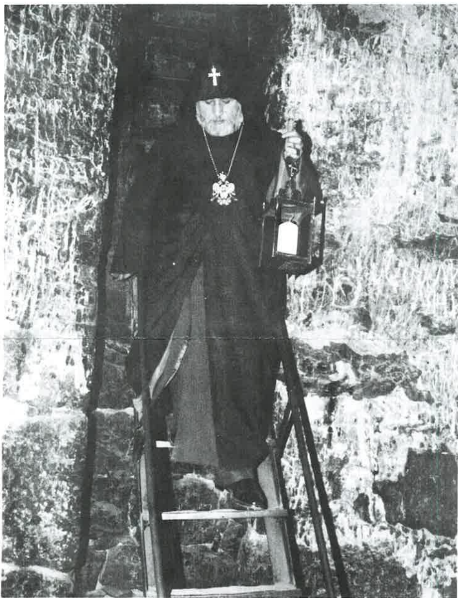
His Holiness Karekin II, Supreme Patriarch and Catholicos of All Armenians, descends into Khor Virab—the pit where St. Gregory was imprisoned—to light the lantern symbolizing the light of Christianity. The “Light of St. Gregory” has been transported to Armenian dioceses throughout the world where the light will burn for the duration of the celebratory year of 2001.

The Catholicos of All Armenians delivered his Christmas pontifical message from the altar of the Cathedral of Holy Etchmiadzin. His Holiness said in part: