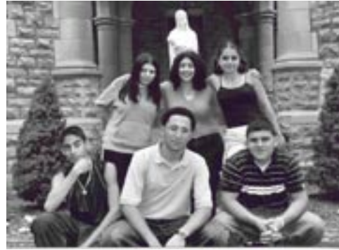
The 2003 graduating class

A program of this scope is made possible through the collaborative efforts between AREC and parishes, parents, volunteer workers, and a number of organizations and individuals. It is meet and right to acknowledge and thank them for their support and contributions to the Institute. In the first place, the Institute wishes to thank the instructors for their labor of love and the parents for entrusting their children to the Institute for a week of spiritual formation. The Institute would like to express its gratitude to the following datevatzies for their invaluable services as supervisors and counselors: Dn. Haig Baklayan, Dn. Nishan Baljian, Dn. Joseph Garabedian, Ms. Barbara Baljian, Ms. Nayiri Baljian, Mr. Arek Hamalian, Dr. Arsen Mekaelian, Mrs. Martha Mekaelian, Ms. Jeanette Nazarian, and Mrs. Marie-Jean Zaat. Many thanks to those parishes that subsidized a portion of the expenses