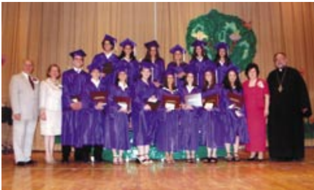
Members of the 2003 graduating class of St. Stephen's Saturday School, Watertown, MA, proudly display their diplomas.