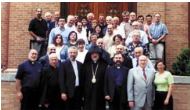
The Prelacy's Executive Council met recently in Whitinsville, Massachusetts, with representatives of area Churches. The Executive Council has embarked on a plan to have its meetings in various different areas and invite representatives of our parishes to share ideas and concerns.