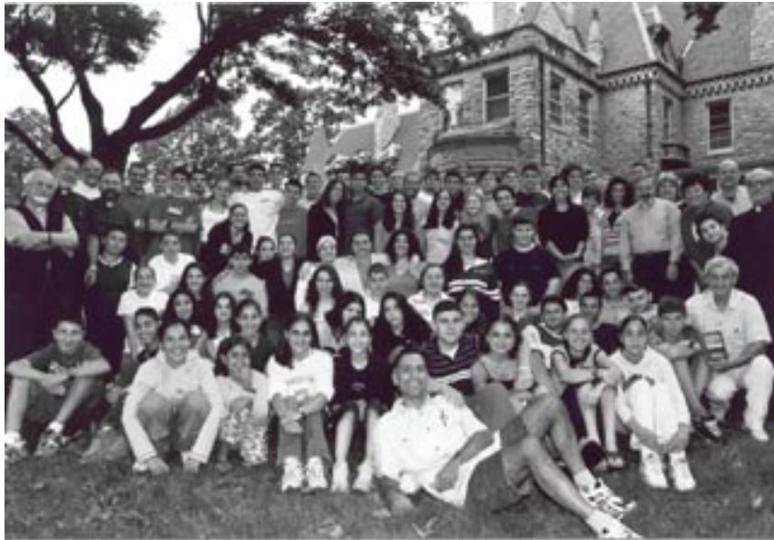
The 2003 Datevatzies with their teachers.

is a four-year (one week each year) faith-based, youth program. Those who complete the 4-year program may return for postgraduate classes. The classes for the five levels of study take place concurrently. This year there were 17 first-year students, 18 second-year students, 11 third-year students, 6 fourth-year students (graduates), and 20 post-graduates.