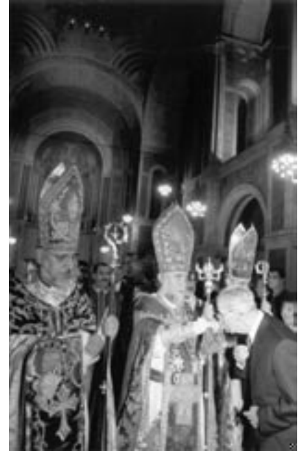
Vehapar is led out of the church by procession at the conclusion of the Divine Liturgy

Speaking out against anti-Christian values that preach against Christian Armenian values, he stressed that