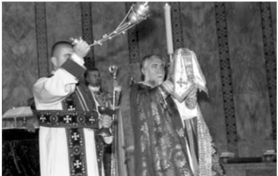
Scene from the Liturgy.

New Jersey and Philadelphia soulfully sang the majestic sharagans, Khorhoort Khorin and Hrashapar . Conducting the choir with expert direction was