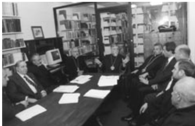
His Holiness meets with members of the Prelacy's Religious and Executive Councils during his visit to the Prelacy office.