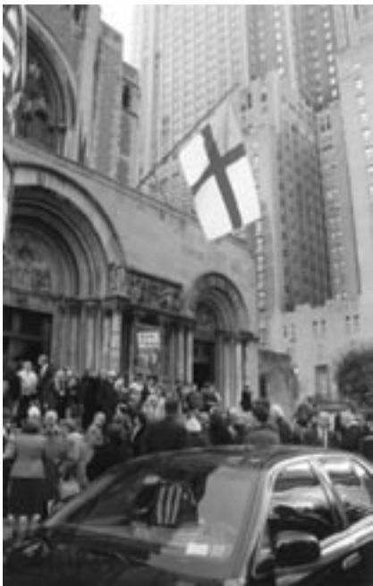
St. Bartholomew's Church on Park Avenue in New York City was the site of the Pontifical Divine Liturgy on October 23.