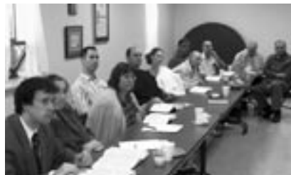
Scene from the Seminar

The Armenian Religious Education Council (AREC) sponsored a day-long seminar at St. Gregory the Illuminator