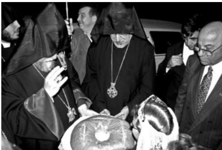
Washington: Vehapar blesses the bread and salt upon his arrival at Sourp Khatch Church, Bethesda, Maryland.

His Holiness concluded the evening with a stirring speech once again focusing on the service provided by the Seminary throughout the Diaspora.