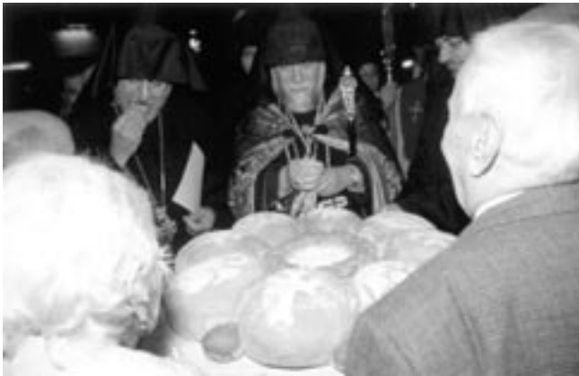
Bread and salt are blessed upon arrival at Sts. Vartanantz Church

The majestic sharagan, “Hrashapar” rang out as two rows of scouts holding candles, escorted Catholicos Aram I of the Great House of Cilicia into New Jersey’s Sts. Vartanantz Armenian Church, on Friday evening, October 21. The large crowd that filled the church greeted him with enthusiastic applause.