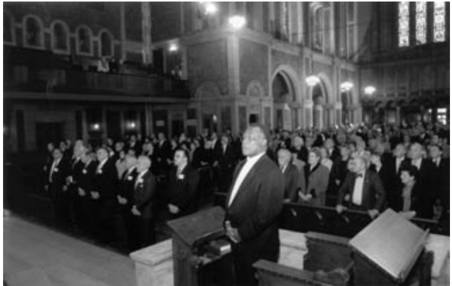
A scene of the Congregation.

The impressive service began with the Vehapar, hierarchical clergy from various ecumenical Christian churches, and more than two dozen high-ranking clergy and parish priests of the Armenian Church slowly walking in procession down the center aisle, as a combined choir from New York,