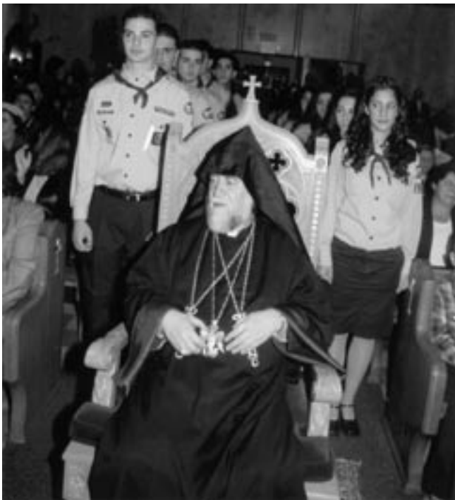
Girl and Boy Scouts stand at attention behind Vehapar.

The evening was a special tribute to the virtues, values and sacred mission of the Seminary of the Catholicosate of Cilicia in Antelias, which has produced so many outstanding clerical and lay leaders, and has had a profound influence among Armenians throughout the world. This visit of His