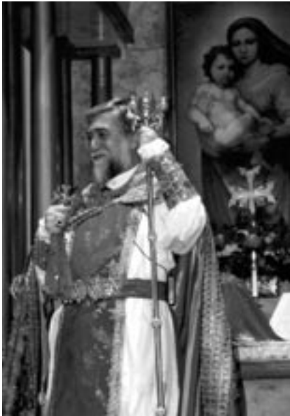
Chicago: Vehapar delivering his sermon to the faithful of All Saints Church.

for many years in the memory of the Armenian faithful and high level ecumenical leaders. Vehapar's collective thoughts, the programs he initiated and organized, and the steps he took have opened new horizons for our church, our people, and for our Holy See."