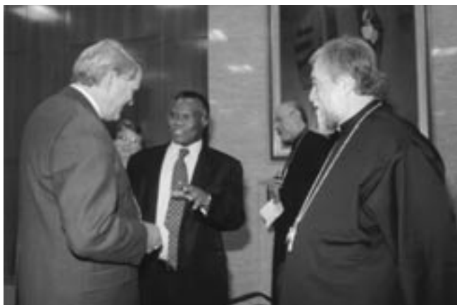
Discussions continued during the luncheon and refreshment breaks.