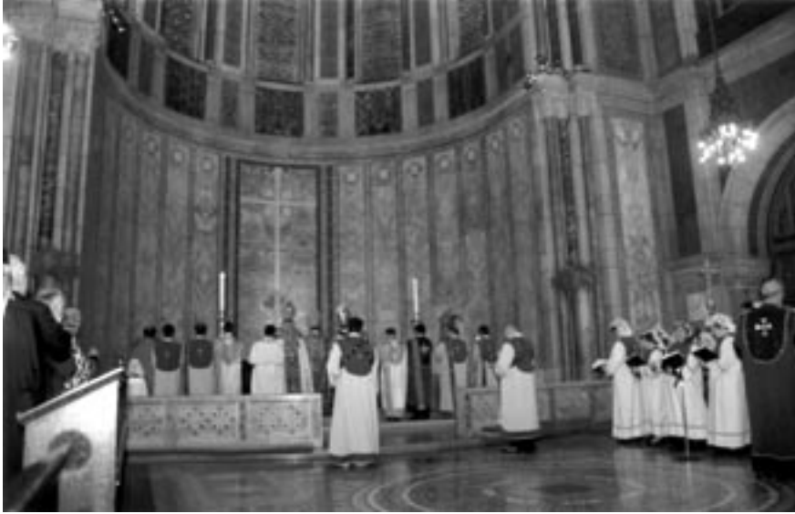
Scene from the Liturgy.