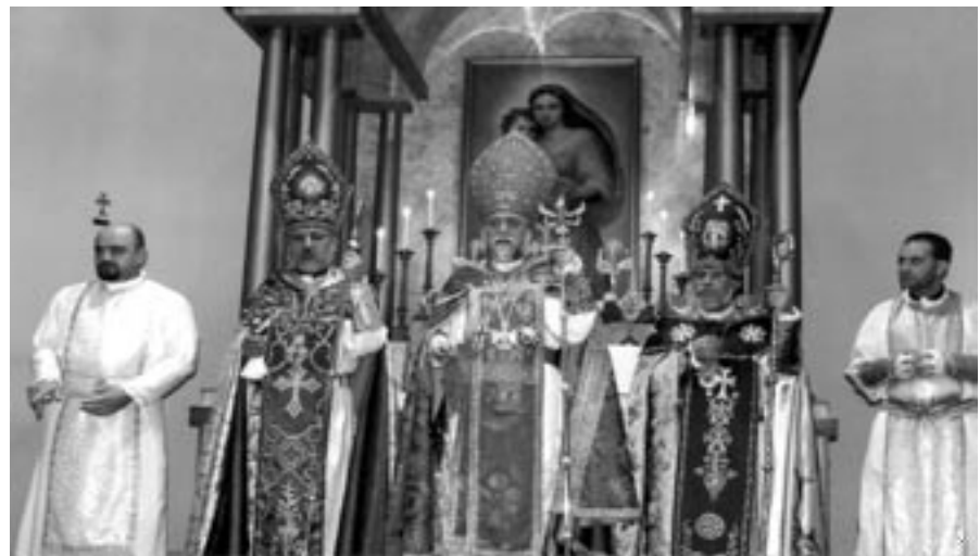
Chicago: A scene during the Divine Liturgy at All Saints Church in Illinois.