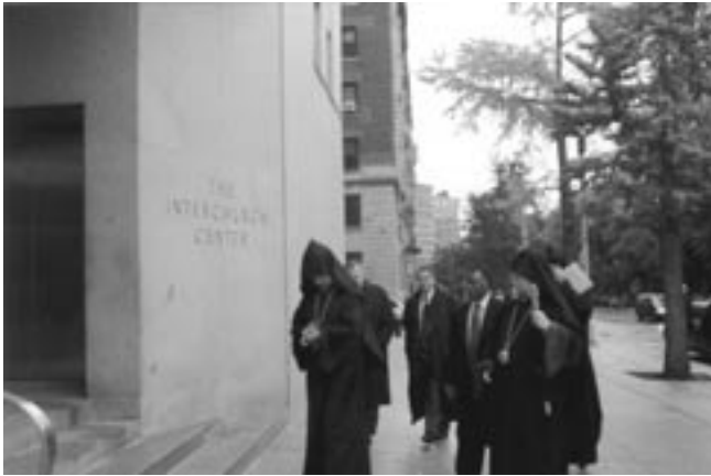
His Holiness arrives at The Interchurch Center on Riverside Drive in New York.

As the Chairman of the World Council of Churches (WCC) for two unprecedented terms, Catholicos Aram I of the Great House of Cilicia, presided over a gathering of Christian church leaders at the Interchurch Center in New York. The World Council of Churches comprises some 550 million Christians within 347 churches in 100 countries.