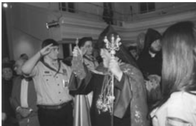
Boy and Girl Scouts lined the center aisle of the Cathedral as His Holiness made his way to the altar.