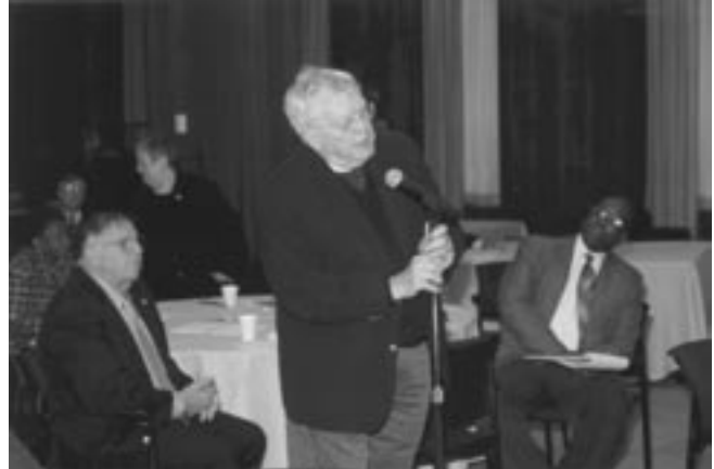
Challenging questions were posed by the audience.

In covering some of the crucial challenges at the present juncture of the ecumenical movement, His Holiness said, "Ecumenism is in search of new identity, self-understanding.