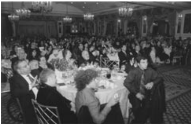
A scene from the gala banquet at the Pierre Hotel in New York.

On Sunday evening, October 23, a Pontifical Banquet was held in the grand ballroom of the elegant Pierre Hotel in honor of the 10 th anniversary of the election and consecration of Catholicos Aram I of the Great House of Cilicia. It was the culmination of His Holiness' visit to the Mid-Atlantic area and followed the Pontifical Divine Liturgy at St. Bartholomew's Church with the participation of the clergy and the faithful of parishes in New York, New Jersey, Connecticut, and Pennsylvania.