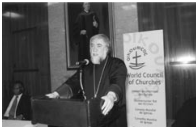
In his closing reflections, His Holiness acknowledged that the Ecumenical Movement is in search of a new identity.