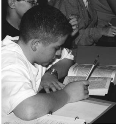
A Datevatsi pondering on the Word of God.