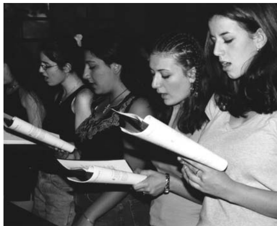
During evening service.