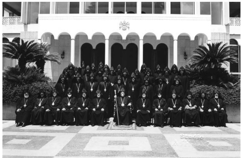
An official photo of the Brotherhood of the Great House of Cilicia taken during the 9th Annual Brotherhood Meeting which took place on June 4th in Antelias, Lebanon.