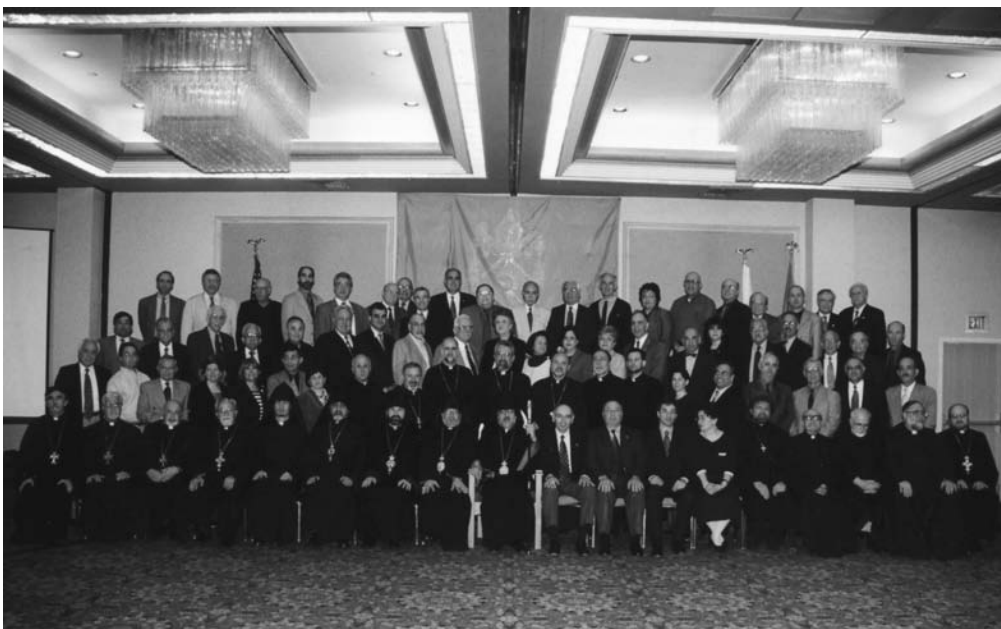
Delegates to the 2002 National Representative Assembly, which convened in Providence, Rhode Island in May, enjoyed the hospitality of the host church, Sts. Vartanantz.