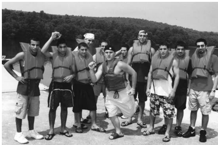
Datevatsi boys gearing up for aquatic fun at French Creek.

light in Philadelphia) for providing delicious Armenian food to the Datevatsies on various occasions during the Program, including the 4th of July picnic.