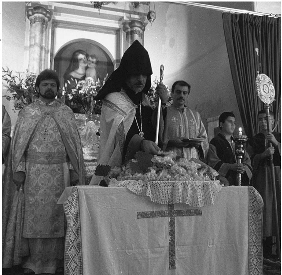
Blessing of the Grapes ceremony at St. Illuminator's Cathedral, August 18.