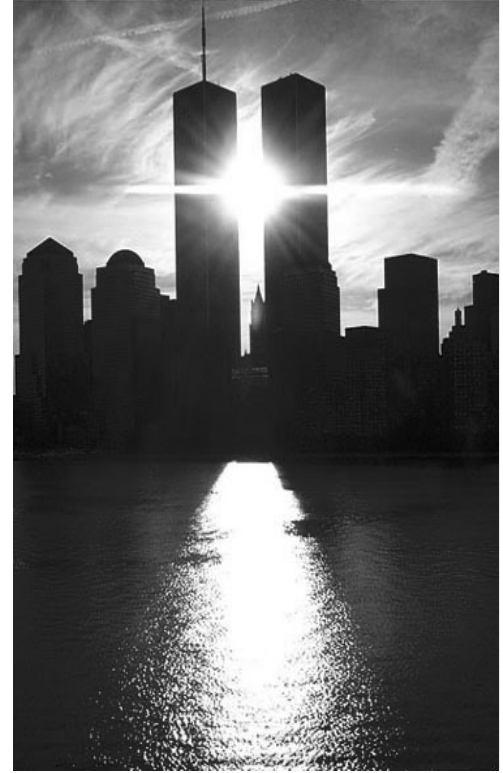
Front Cover: Freedom Flag, from the series "Celebrating Freedom 9/11 NY" by SHANOOR.

This year's Mothers' Day luncheon sponsored by the Prelacy Ladies Guild honored the mothers and wives of 9/11 victims. The wives and mothers of the Armenian victims were present as representatives of the greater group. Here they are shown with the Prelate, Archbishop Oshagan, who presented them each with a khatchkar (stone-cross).