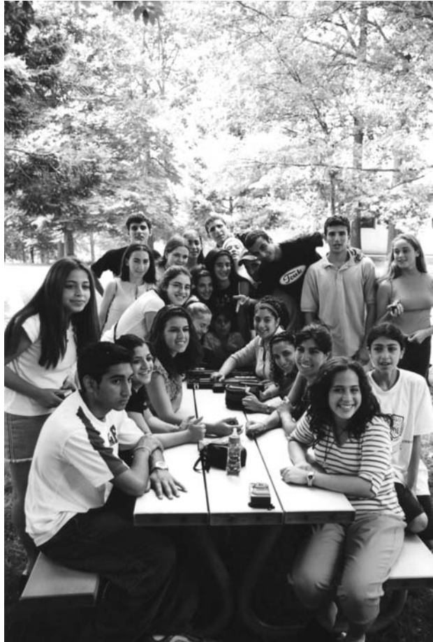
Participants of the St. Gregory of Datev Institute Summer Christian Studies Program gather around to celebrate July 4th.