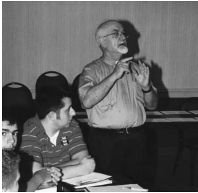
A time to learn.

teachers truly know what to teach. Datev provides us with Bible studies, church services, open-group discussions and other activities related to our faith. Attending Datev is like having a door opened within