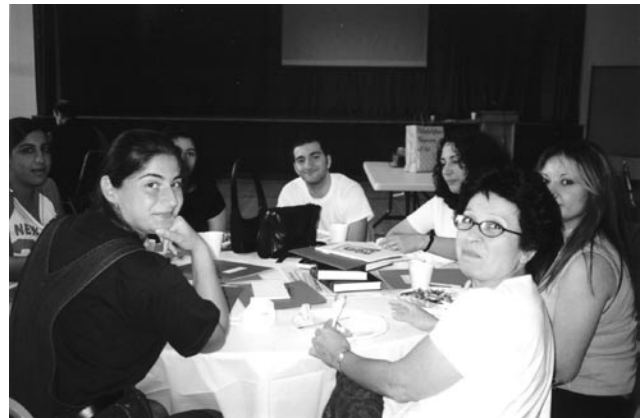
A scene from the seminar.

Day schools represented included: Holy Martyrs Armenian Day School, Bayside, NY; Armenian Sisters Academy, Lexington, MA; Hovnanian School, New Milford, NJ. Teachers from the following one-day schools included: Hamasdegh School, Washington, DC; St. Gregory the Illuminator, Indian Orchard, MA; Kirikian Armenian School, Tenafly, NJ; Siamanto Academy, Woodside, NY;