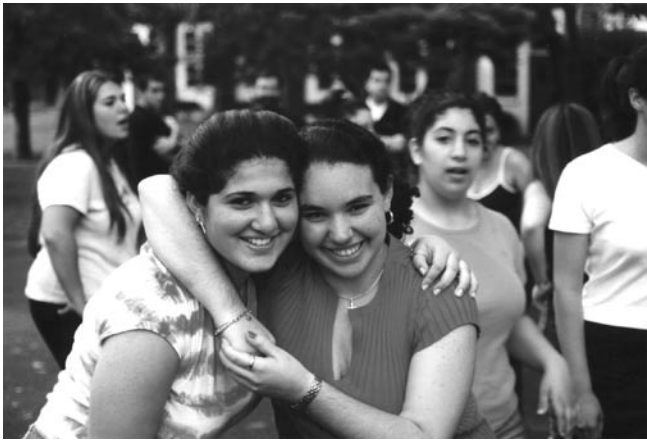
A time for fellowship.

D atev this year has been an uplifting experience. I