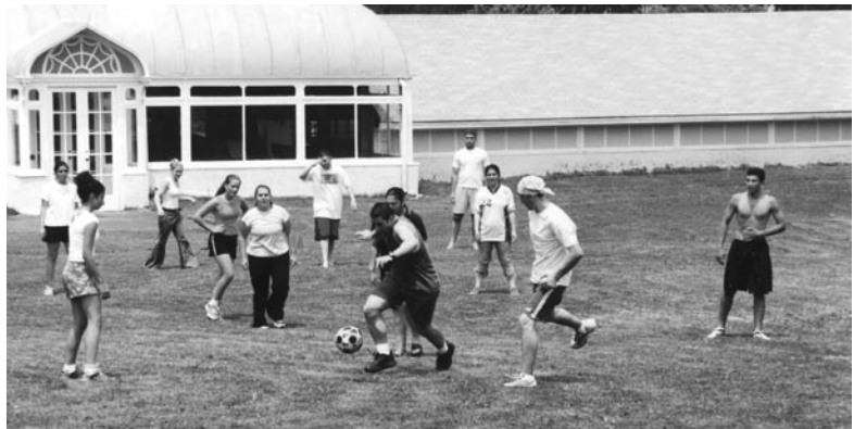
A time to play.

W hen friends in school ask, “What did you do over the summer?” most of the Datevatzies would answer, “I attended a religious camp somewhere in the middle of Pennsylvania for a week.” To our friends, these words are meaningless. However, as a first year Datevatzi, I know that these words hint of what Datev is all about. But the