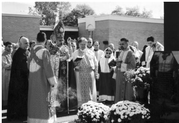
A special service at the Memorial Monument.