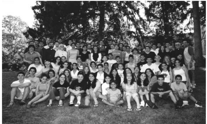
2002 Datevatzis gather together.