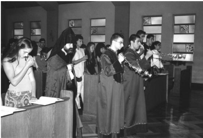
A time to pray.

help strengthen your spirituality, but I believe otherwise. While it is true that my spirituality is heightened each year, I believe the true meaning of Datev is to become a better person. . . .