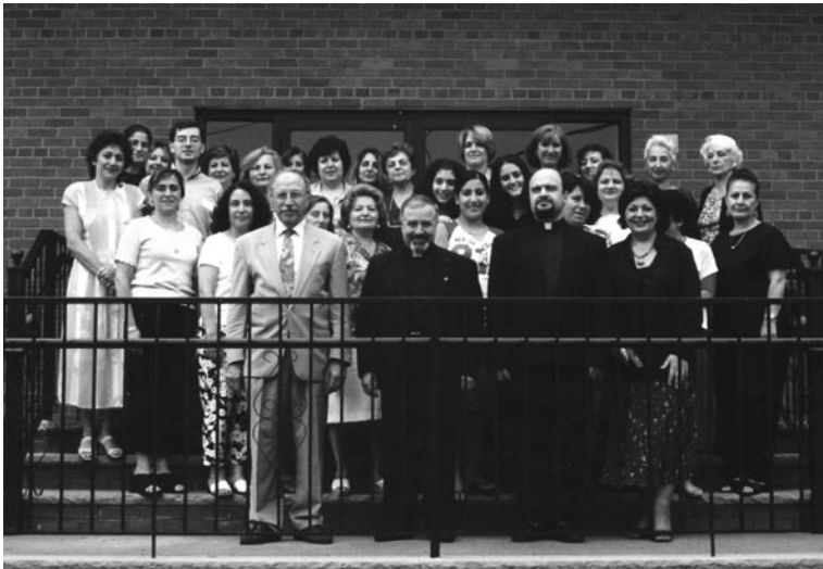
The speakers with the participants of the ANEC Educators Seminar.